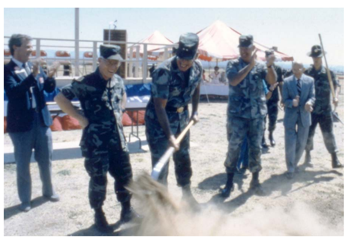
MG Menoher participates in the ground breaking ceremony for the new facilities that would become Prosser Village on Fort Huachuca in 1991. The project was due to consolidation of the MI training that resulted from the 1988 Base Realignment and Closure Act.