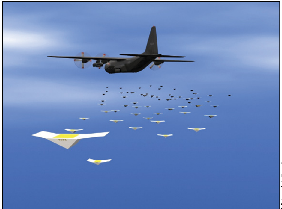
U.S. Army photo illustration

By 2025, airspace over future battlefields will be extremely congested and potentially dangerous.