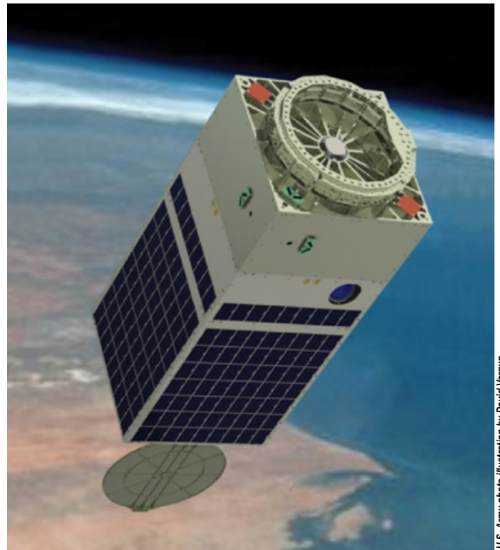
U.S. Army photo illustration by David Vergun

solution strategy includes platforms, sensors, PED, network/architecture, and SIGINT/EW/cyberspace integration.