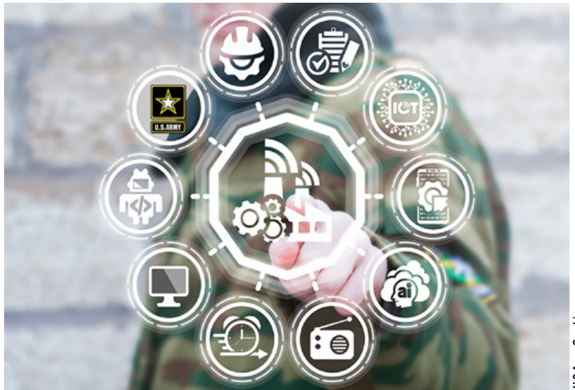
A collaborative effort between Army researchers has resulted in a tool that will enable the Army to model, characterize, and predict the performance of current and future machine learning-based applications on mobile devices. The soon-ending Network Science Collaborative Technology Alliance made this effort possible.

Platforms: The manned AISR fleet will transition from vulnerable platforms to survivable ones, in part through incorporating a full suite of advanced, effective aircraft survivability equipment. Future aircraft operating in large-scale ground combat operations will need to specialize in one of