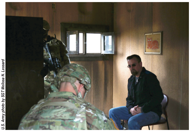
Soldiers with 163<sup>rd</sup> Military Intelligence (MI) Battalion, 504<sup>th</sup> MI Brigade, complete an interrogation exercise as part of certifying their MI platforms on Camp Bullis, TX, March 20, 2019.

As CI and HUMINT operations have long lead times, leadership can often attribute preparation of operations as a lack of forward movement. This results in the use of CI and HUMINT forces for garrison duty, or other necessary support functions, but detracts from the intelligence collection mission. Similarly, many individuals often overlook collection management and do not view it as the critical function that it is. Collection elements may engage directly with their analytical cell to ensure a clear understanding of collection requirements and discuss collection opportunities generating notices of intelligence potential. While analyst-collector engagement is essential to support operations, collection management is a key partner in this dialogue to ensure the translation of analytical priorities through the lens of overall focus areas as part of a larger regional and Army strategy. Without effective collection management, collectors risk focusing their efforts on information that is not a priority collection area.