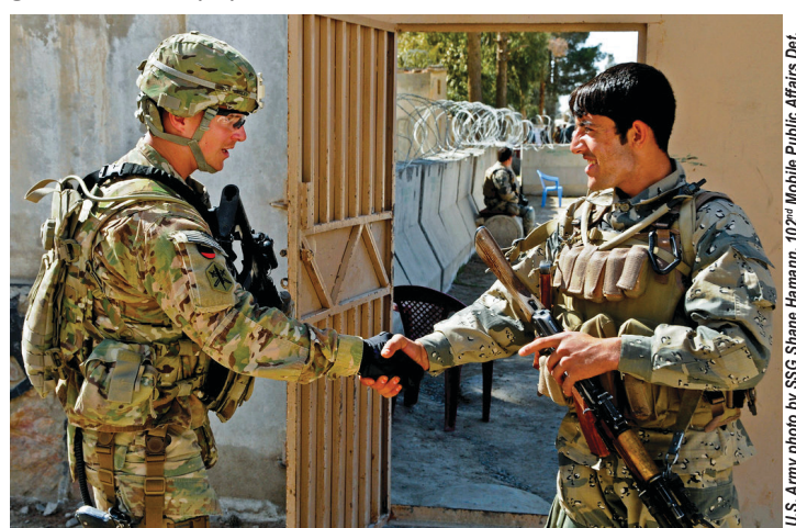
A U.S. Army Soldier and Afghan Border Policeman exchange greetings after assignment providing security to the same area at the Spin Boldak, Afghanistan district center for a district leaders' shura, on February 11, 2013.

Modernization of Army HUMINT means transitioning from the experience of deployed counterinsurgency operations in support of targeting to using Army HUMINT full spectrum capabilities throughout each phase and domain across the continuum of conflict to support modernization, set the theater, shape battlespace understanding, and enable commanders' decision making. HUMINT is critical to increasing lethality of the force and opening windows of opportunity across all domains by providing commanders with detailed knowledge of threat strengths, weaknesses, intentions, organizations, equipment, and tactics.