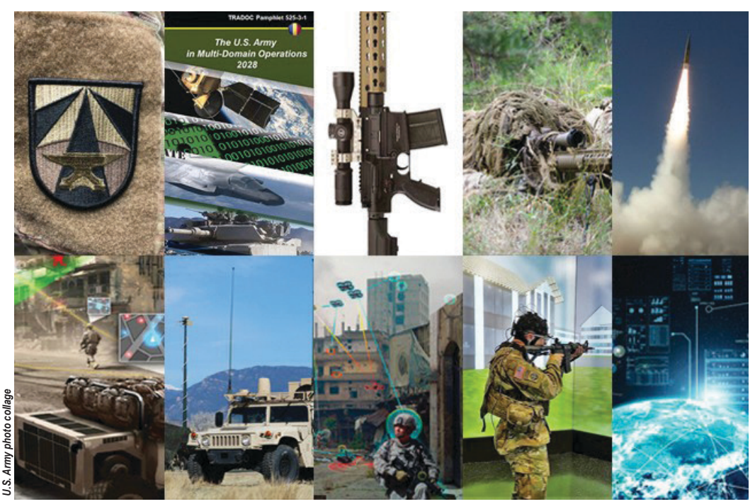
For the past two years, the Army has initiated many changes to help modernize the force. Among those changes, Army Futures Command found a new home, Soldiers began receiving a new rifle, and the Army made strides to improve its hypersonic, networking, and artificial intelligence capabilities.

From the National Defense Strategy to the Army Posture Statement, these important documents acknowledge the challenges the U.S. Army faces in an ever-competitive global security environment. The reemergence of Russia and China as pacing threats and the nuclear ambitions of rogue nations such as North Korea and Iran command our attention, and transregional terrorist groups remain a persistent threat. Given the multitude of capabilities associated with current and potential adversaries, the Army's challenge to prevail in unified land operations, as well as our institutional base to train and educate the next generation of Army leaders, has never been greater. Perhaps the best guidance I have read is in the Fiscal Year 2020 Combined Arms Center Command Guidance . It says, "Enable the Army to transition the current [counterinsurgency] COIN-centric fielded