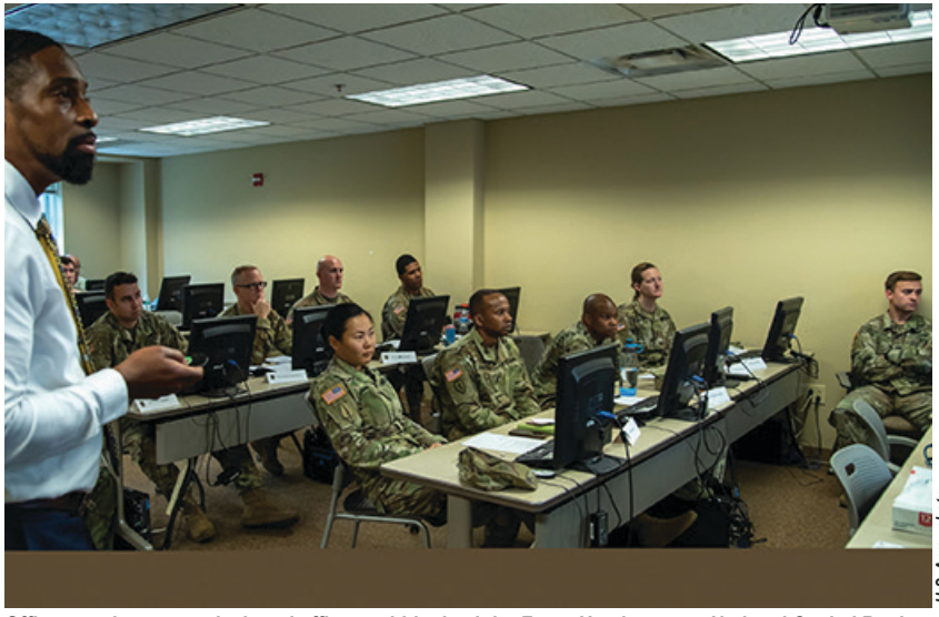
ticipates discussions about CBRN as a battlefield condition in future large-scale combat operations. Officers and noncommissioned officers within the Joint Force Headquarters-National Capital Region and the U.S. Army Military District of Washington participated in a week-long Company Commander/ First Sergeant Course on Joint Base Myer-Henderson Hall, VA, 28 October to 1 November 2019.

Replicating contested multiple domains in the classroom for Army centers and schools is a greater challenge than